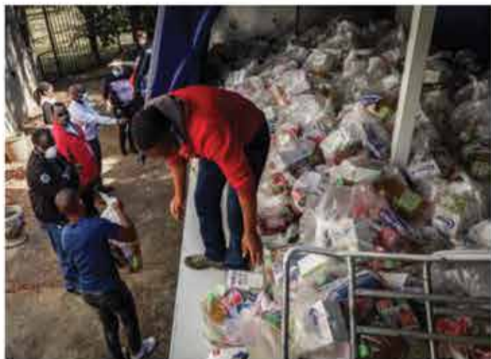
Thousands of food parcels were distributed.