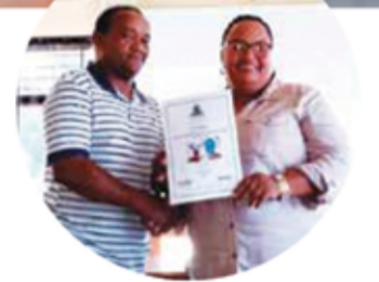
Participants at the training courses